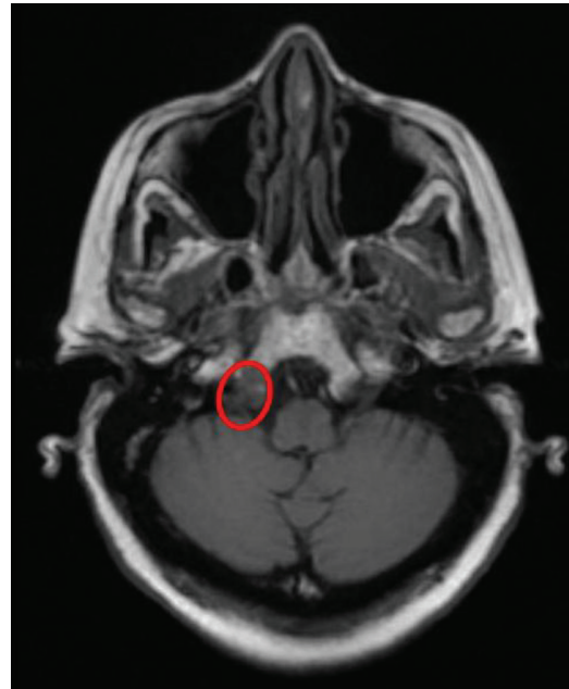
Figure 2. Eroded occipital condyle affecting the hypoglossal nerve.

Untreated MM can have several serious side effects as this case reveals. MM causes severe osteolytic destruction via cytokines, specifically IL-1, which then activates RANK-L on osteoclasts [9]. When the disease is markedly uncontrolled, as was revealed in this case, there is marked bone remodeling and lysis throughout the body. Impingement of the hypoglossal