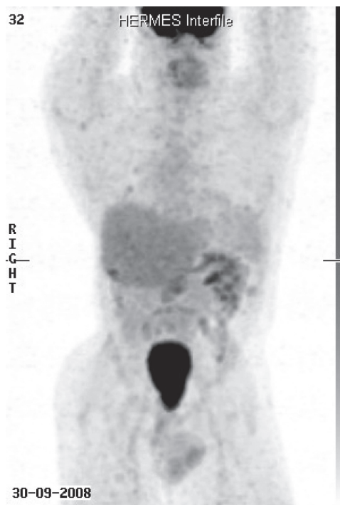
Figure 2. Staging positron emission tomography-CT scan showed uptake in the para-aortic region, the liver, a nodule inferior to the spleen, a nodule anterior to the proximal right latissimus dorsi muscle and variable uptake in the pulmonary nodules.

When first seen at the Cancer clinic, he appeared to be a pleasant, average built man with extensive scoliosis of his spine. He had an enlarged liver and axillary and submental lymphadenopathy. He underwent an excision biopsy of the axillary node. Histopathology was consistent with leiomyosarcoma, with well encapsulated, moderately pleomorphic and mitotically active smooth-muscle tumor. Desmin stain was positive and smooth muscle actin stain showed patchy positivity; AE1/AE3, S100 and C-Kit and EBER were all negative. Staging CT scans were performed which showed multiple metastases (Fig 1). A staging positron emission tomography-CT scan showed uptake in the para-aortic region, the liver, a nodule inferior to the spleen, a nodule anterior to the proximal right latissimus dorsi muscle and variable uptake in the pulmonary nodules (Fig 2). The investigations confirmed a diagnosis of RIS of LMS subtype, with dominant mass in the previous radiotherapy site and extensive metastases almost three decades after his initial treatment. He was offered palliative chemotherapy, but he declined and went onto having various alternative therapies and finally succumbed to his cancer nearly 12 months after the diagnosis.