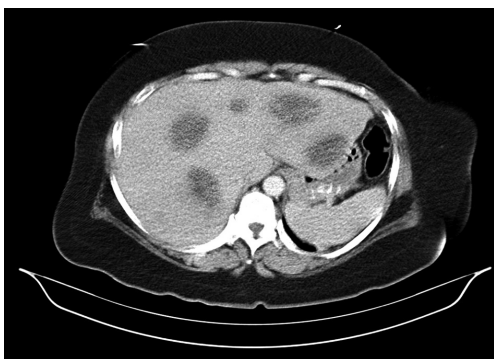
Figure 1. CT scan of the abdomen and pelvis with and without contrast illustrating multiple liver lesions, largest measuring 4 to 5 cm.