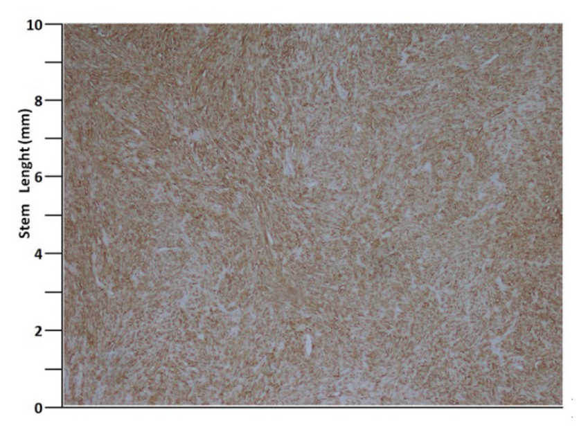
Figure 3. Actin, × 40.

origin and it creates a different form with sarcomatoid differentiation. Operation materials and specimens of these patients obtained during diagnostic procedures for sarcomatoid carcinoma also indicate that the simultaneous carcinomas contain high-grade epithelial components [10]. Thus, sarcomatoid differentiation is more common in the presence of high-grade tumor. Receiving therapies such as hormonal therapy and/or radiation therapy is considered to trigger sarcomatoid differentiation [10].