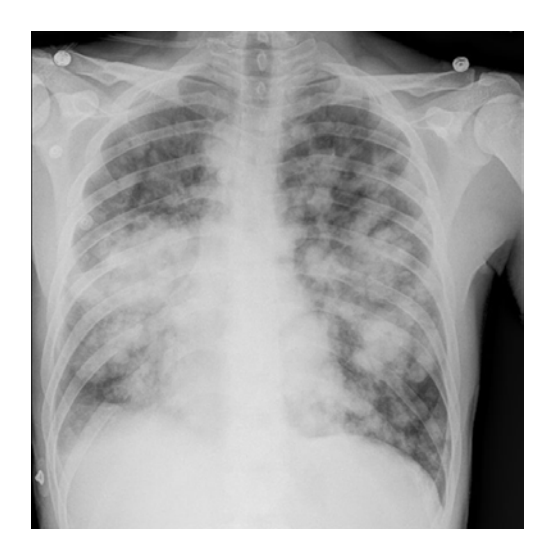
Figure 1. Chest X-ray showing bilateral rounded airspace opacities

Based on patient's history of IV drug abuse, recent episode of cellulitis, concomitant lower back pain and consis-