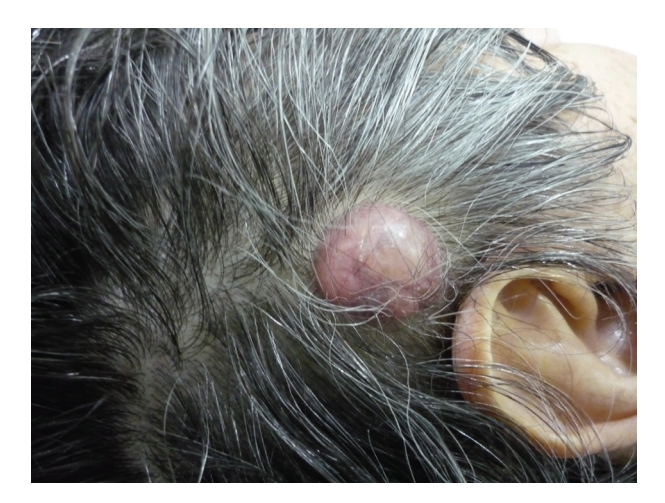
Figure 2. Gross photo of the metastatic lesion of the scalp.

hemorrhagic, ulcerated mass of the rectosigmoid area causing obstruction. Serum tumor markers were CEA > 1,500 ng/mL and CA19.9 > 1,200 U/mL. Histological examination of the tumor revealed a G2 grading adenocarcinoma of the colon. CT scans of the thorax and abdomen detected metastatic disease of the lungs and liver (Fig. 1) respectively (stage IVb). Hence, a self-expanding stainless steel stent was successfully endoscopically placed. The patient began systemic therapy with FOLFOX plus bevacizumab. Four months later the stent was obstructed from tumor ingrowth and a new stent was placed (stent to stent) while a subsequent CT scan confirmed progression of disease. At that time, patient presented a cystic lesion of the scalp at the right temporal area (Fig. 2). Histological analysis of the excised lesion of the scalp revealed a metastatic medially differentiated adenocarcinoma, most likely originating from the large bowel, which infiltrated the subcutaneous tissue and the skin (Fig. 3). A palliative care was followed as he had rapid physical decline and he was discharged home under a nursing care where he died 2 weeks later.