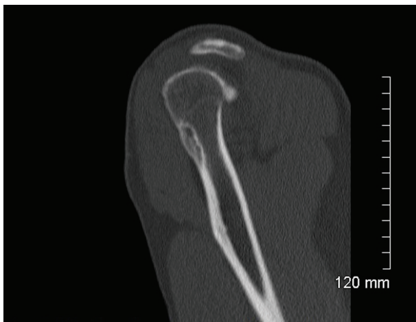
Figure 3. CT hypodense lacunar formation on the front cortical bone.

The positive diagnosis was obtained through a bone biopsy carried out under scan control. The anatomopathological analysis provided arguments in favor of an osteoblastoma due