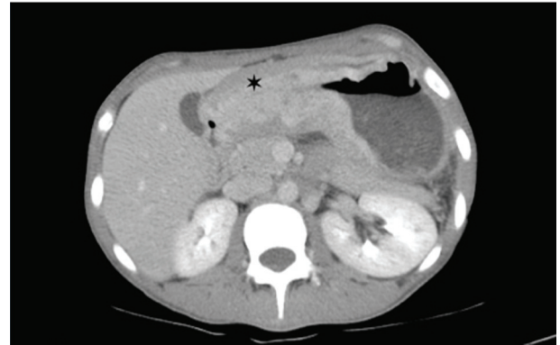
Figure 3. Abdominal tomography with intravenous contrast revealing intense thickening of the gastric wall with diffuse narrowing in the prepyloric region (asterisk).

Upper digestive endoscopy, method of choice for diagnosis in these cases, is considered low-risk procedure during